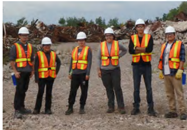
SRC launched the Student Environmental Monitoring Program in 2016

Project CLEANS was also featured in the report for its procurement practices. SRC uses an Athabasca Basin representative during its procurement evaluation process. Additionally, Athabasca Basin companies are encouraged to participate in request for proposal submissions.