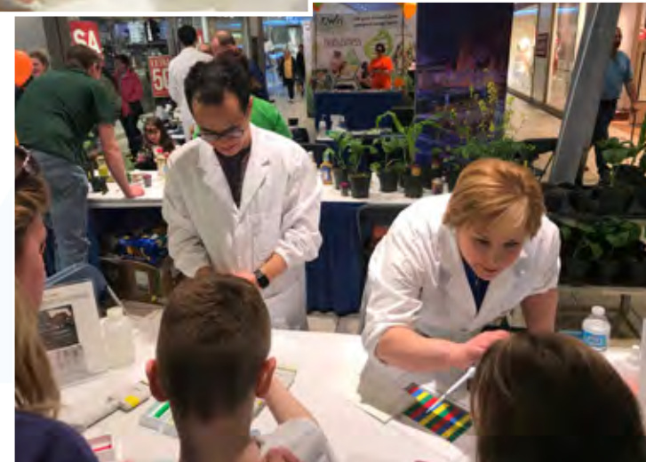
Employees from Biotechnology Laboratories lead activities at Ag in the City Sask