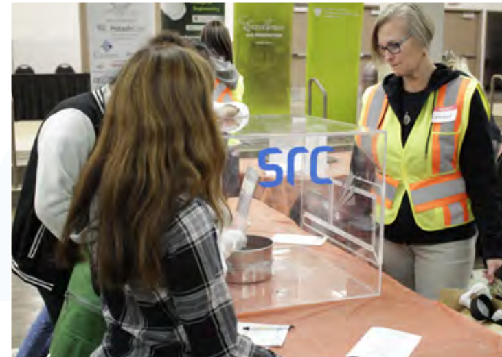
Students sorted through rocks and beads using SRC's demonstration diamond glove box at Mining 4 Society