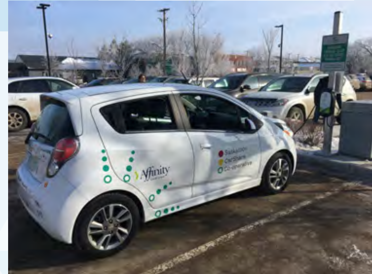
SRC will be collecting and analyzing performance data as a part of the Renewable Rides project