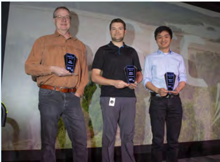
Winners of the Everyday Role Model category

The Everyday Role Model award was given to three individuals at SRC, who were nominated by their peers. This award was designed to recognize those who go above and beyond their job requirements, with respect to safety. This can include engaging in activities such as identifying and controlling hazards, integrating health and safety into task planning, promoting safety in the workplace and identifying opportunities for improvement.