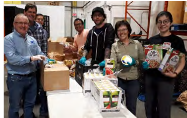
Employee Volunteer Program participants working in the Regina Food Bank warehouse

I felt that the session our summer camp youth had experienced with the STEM team was one of great practical value. I really liked how hands on the activity stations were! Not only was the session valuable for the youth that it was geared towards educating, but it was also valuable to the volunteers delivering the experience to the kids. These sessions allowed for mentors to bridge a connection to the ideas of tomorrow's young leaders.