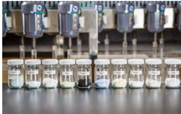
Sample of rare earth elements at SRC