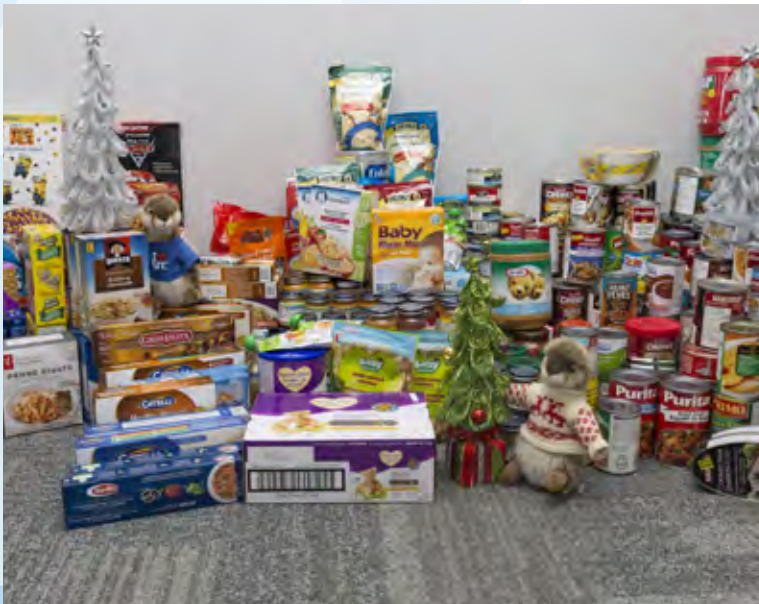
More than 700 items of food were donated by SRC employees to local food banks over the holiday season