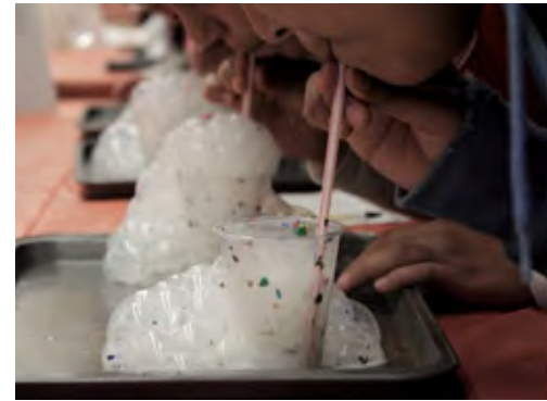
Glitter and milk combine to demonstrate mineral separation by froth flotation at SRC's table at Mining 4 Society