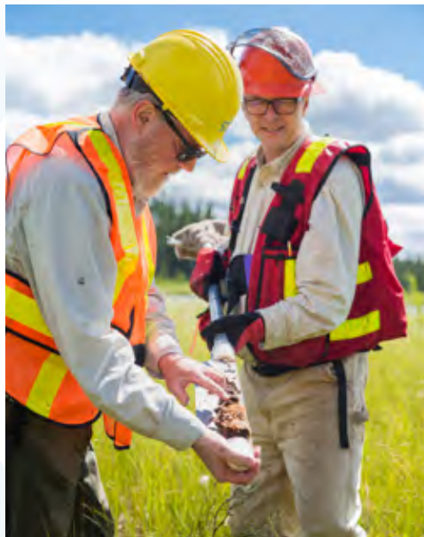
Members of the project team gather peat for sampling

wetlands occur in wet and cold conditions, the biomass doesn't break down - it accumulates and gradually becomes peat over many centuries. It can be several metres deep in places. That dead biomass accumulating as peat is about 90 per cent carbon! Due to the lack of decomposition, peat deposits can be hundreds, even thousands, of years old.