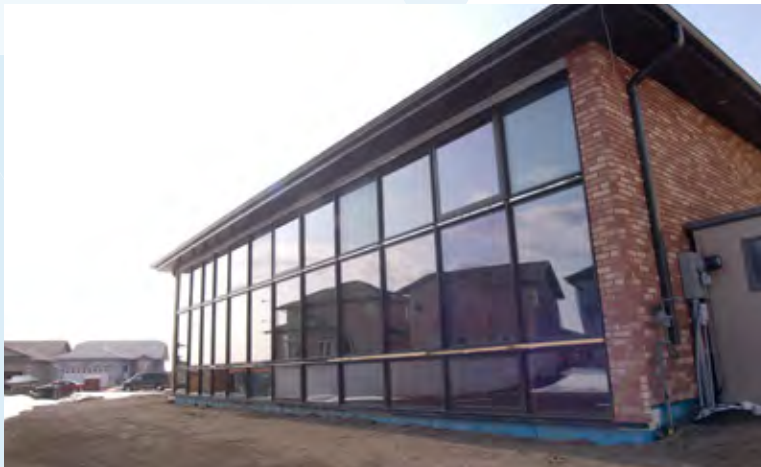
Factor 9 Home was built in 2007, with SRC providing input into the mechanical systems and monitoring the building and systems

For the next 30 years, SRC studied the effects of high levels of insulation, airtight buildings, high-efficiency systems and appliances, as well as innovative features to reduce the environmental impacts of typical modern homes.