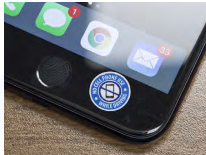
SRC launched an internal Safety at Home campaign that included a focus on preventing distracted driving