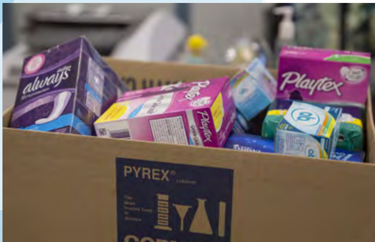
Feminine hygiene products were collected as a part of the United Way of Saskatoon's Tampon Tuesday campaign