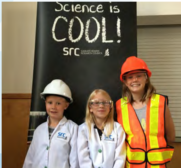
SRC's Aboriginal Mentorship Program participants became the mentors as they led activities at a Boys and Girls Club of Saskatoon day camp