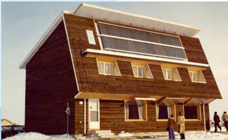
Saskatchewan Conservation House

As a result, Saskatchewan residents were looking for ways to reduce energy costs for their homes. In response, the Government of Saskatchewan called on SRC to project manage the development of an energy conservation demonstration home, called the Saskatchewan Conservation House.