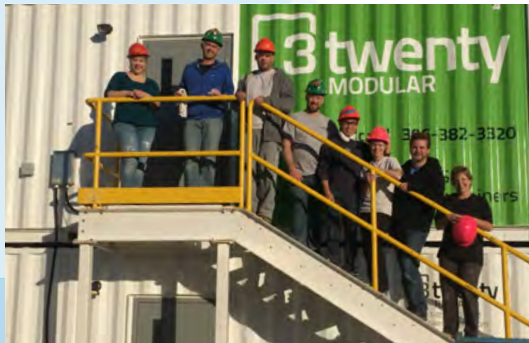
Members of SRC's Strategic Initiatives Division volunteered at a Habitat for Humanity home build