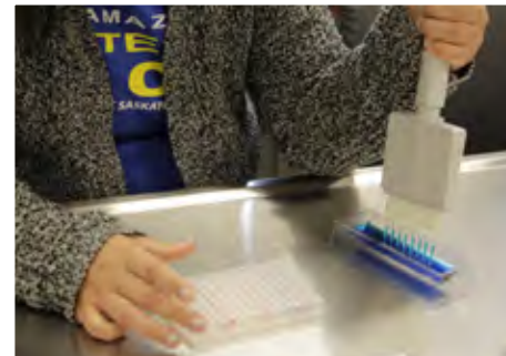
Students from Saskatchewan Polytechnic stopped at SRC's Biotechnology Laboratories during the Amazing Biotech Race