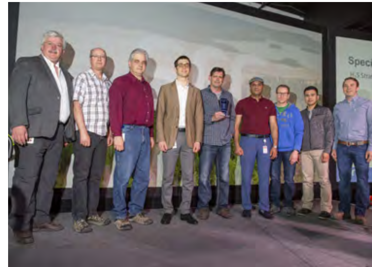
Members of the winning Special Projects team

Employees could also nominate an individual or team for the Special Projects award. This was awarded to an individual or group at SRC that significantly impacted safety during a project or by developing a new method or innovation.