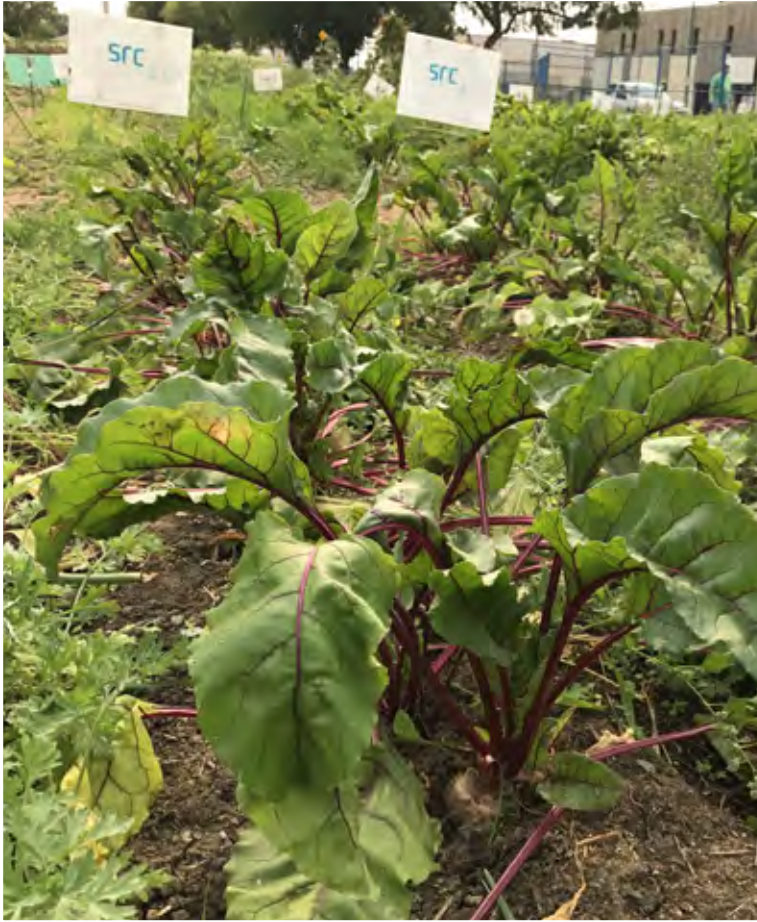
SRC volunteers grew vegetables for the Saskatoon Food Bank and Learning Centre