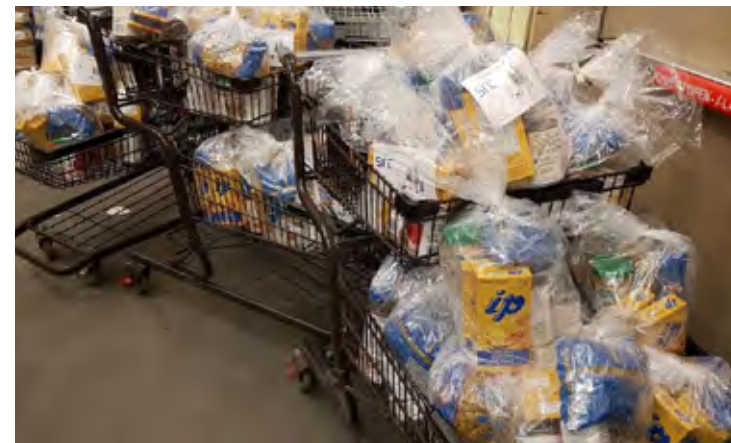
A contribution was made by the Environmental Remediation Business Unit toward food hampers for Fond du Lac, Sask community members

SRC employees do "regular food drives, bring their children to get involved in giving back, and have educated their company about our cause and our mission. SRC is a champion for our community, and their dedication has served as a vibrant model for volunteer and employee engagement that has yielded powerful results."