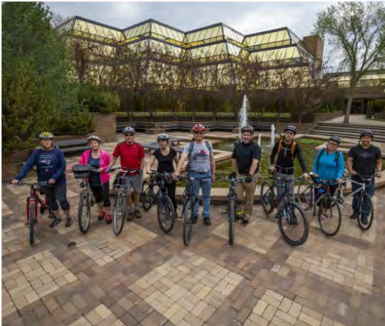
Employees participated in Bike to Work Day Saskatoon and Commuter Challenge Week