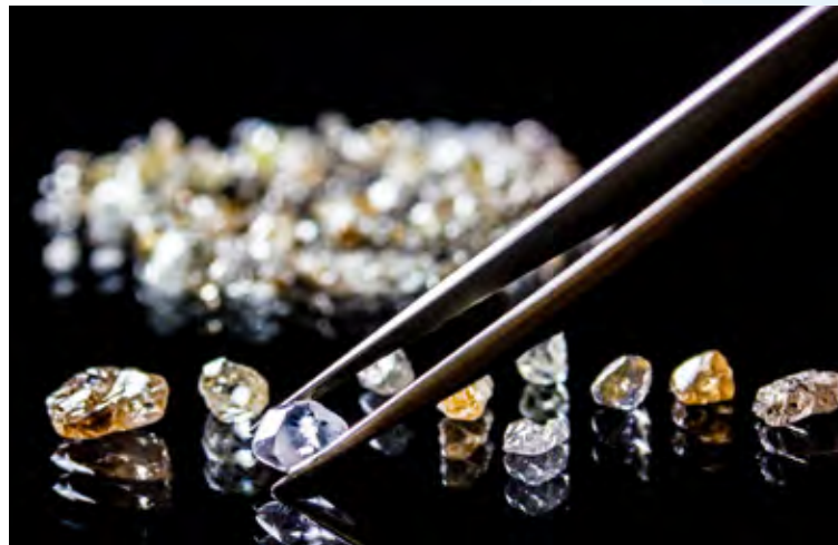
An exploration parcel of diamonds for evaluation

While the work is still ongoing, these services could result in both environmental and efficiency impacts should a mine be developed at Fort à la Corne. "That's what we're working towards," explains Mark Shimell, "We want to minimize the footprint of the tailings facility." Knowledge gained from investigating diamond characteristics may also result in more efficient processes for diamond recovery.