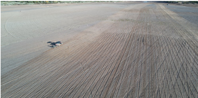
Seeding Gunnar Main Tailings in Fall 2021

The Langley Bay tailings area was not completed due to high water levels in Lake Athabasca. Planning is underway to determine when the remaining work will be completed.