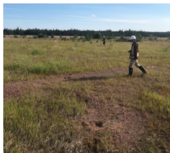
Lorado Mill tailings cover is revegetating as anticipated.

In 2022, transitional monitoring will continue to support the eventual transfer of the remediated site to the Government of Saskatchewan’s Institutional Control Program.