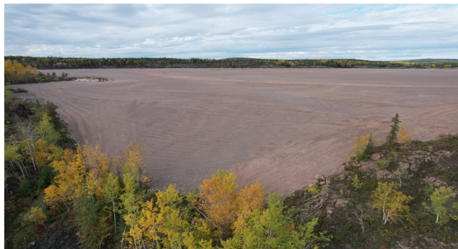
Completed Gunnar Main Tailings Cover