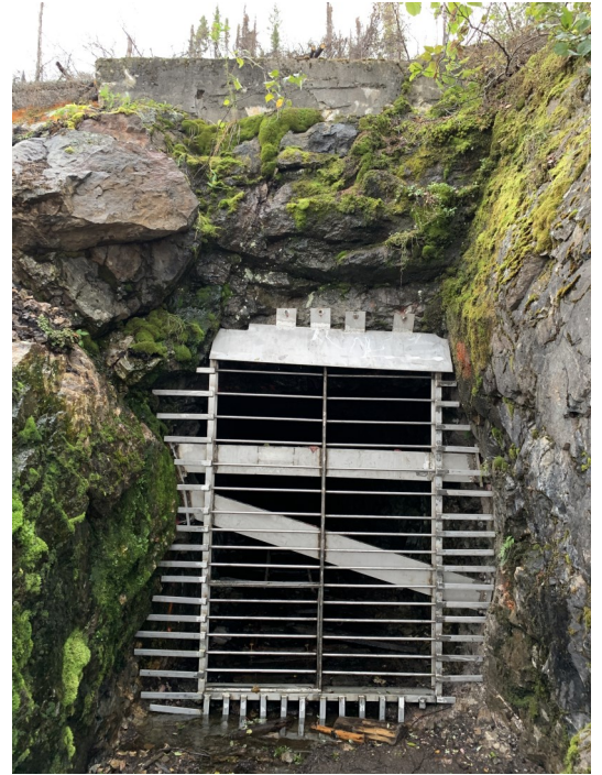
Gulch Adit Stainless-steel Grate Closure

Radiation surveys were completed at National Exploration Mine – Pat Claims, Strike Lake Mine and Gulch. The data collected will allow reporting on the completed remediation of the three sites. Radiation surveys were also carried out at select sites to support remediation plan development. Several mine openings were inspected and surveyed to support the design of closures to be installed during the 2021 field season. The site assessment for Nicholson Mine was initiated and consisted of sampling of soil, waste rock and water, test pitting, survey, hazardous materials assessment, and investigation of mine openings and bed-rock quality.