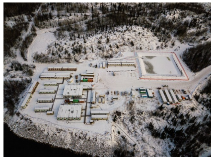
Additional Camp Units Were Setup